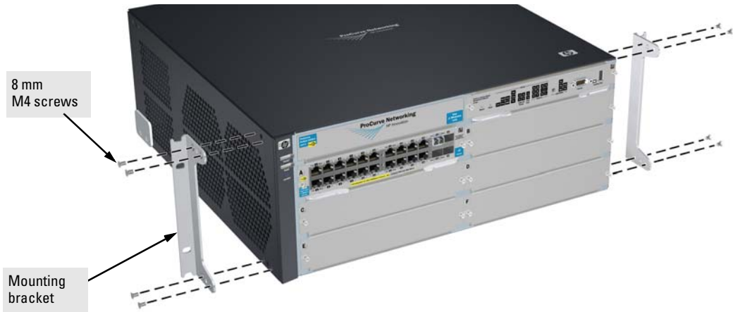
Figure 3. Attaching Rack Mounting Brackets