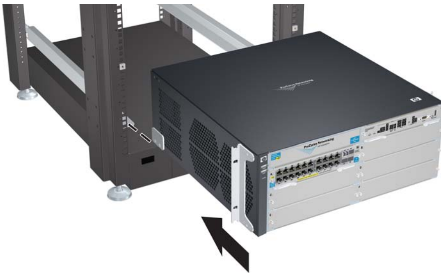
Figure 4. Notches in Bracket Being Installed