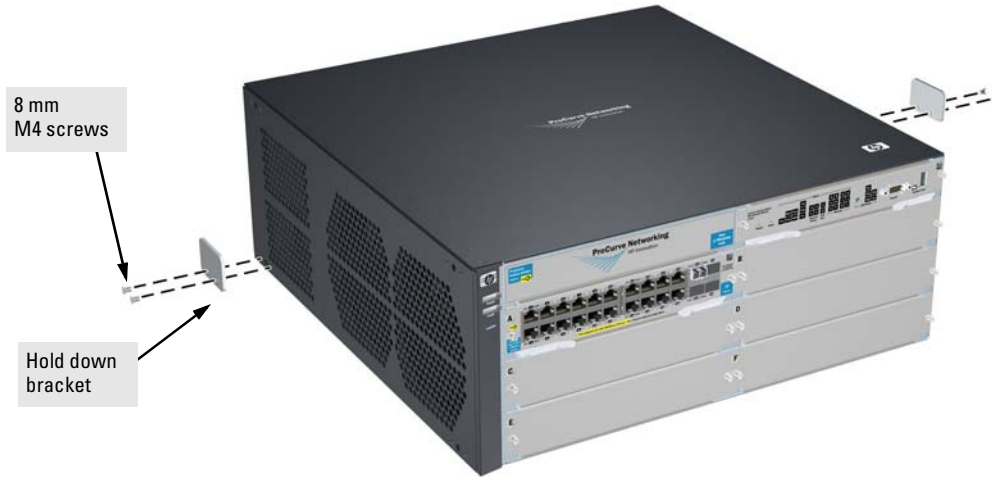
Figure 2. Attaching Hold-Down Bracket